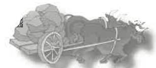
I Kings 19:10, 20