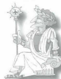
ORDERED JESUS TO DIE