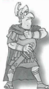
PIERCED JESUS' SIDE WITH A SWORD

WHOSE FAULT IS IT THAT JESUS WAS CRUCIFIED? CHOOSE FROM THE NAMES AT THE BOTTOM OF THE PAGE AND WRITE THE NAMES OF THE PEOPLE IN THE BLANKS UNDER THE PICTURES.