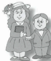
NEEDED JESUS TO DIE FOR OUR SIN