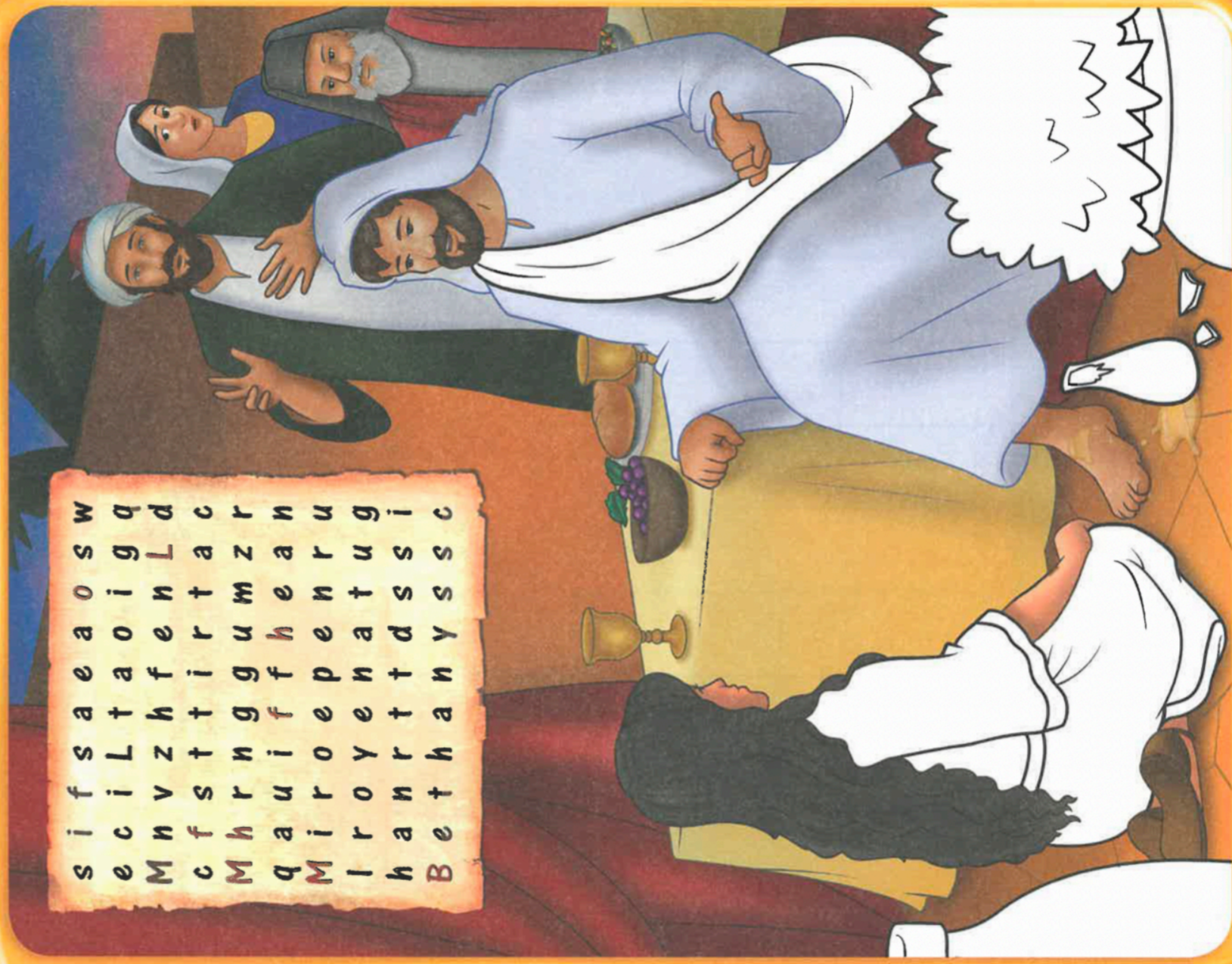
Mary anoints Jesus.

s i f s a e e a t h t g f e e t h a n y e c n f h a i r o y r h a n t M c M q M l h B a o i n t m e n t s s s s g L a z a r u s s w q d c r n u g i c